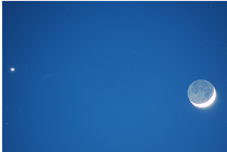
Venus & Moon April 19/07; Nikon D50